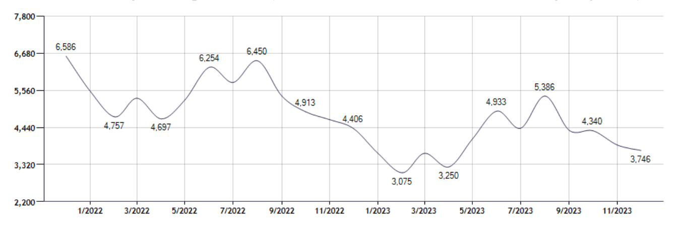
Sold Property Counts for: Location: OneKey MLS Regional Area (Last 24 Months - Residential, Condo, Co-op Properties)

Note: Information displayed in the data table is compiled by OneKey® MLS and represents a combined total of Residential, Condo, Co-op Properties sales for the selected time frame. Only available data will be displayed. Please note that small data samples will skew the % of change year to year. This information is intended for marketing purposes only. To access more detailed market reports visit https://www.onekeymls.com/market-statistics